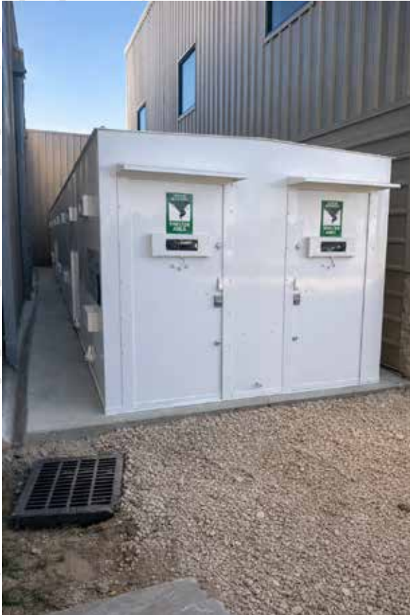
School Shelter Argyle, Texas