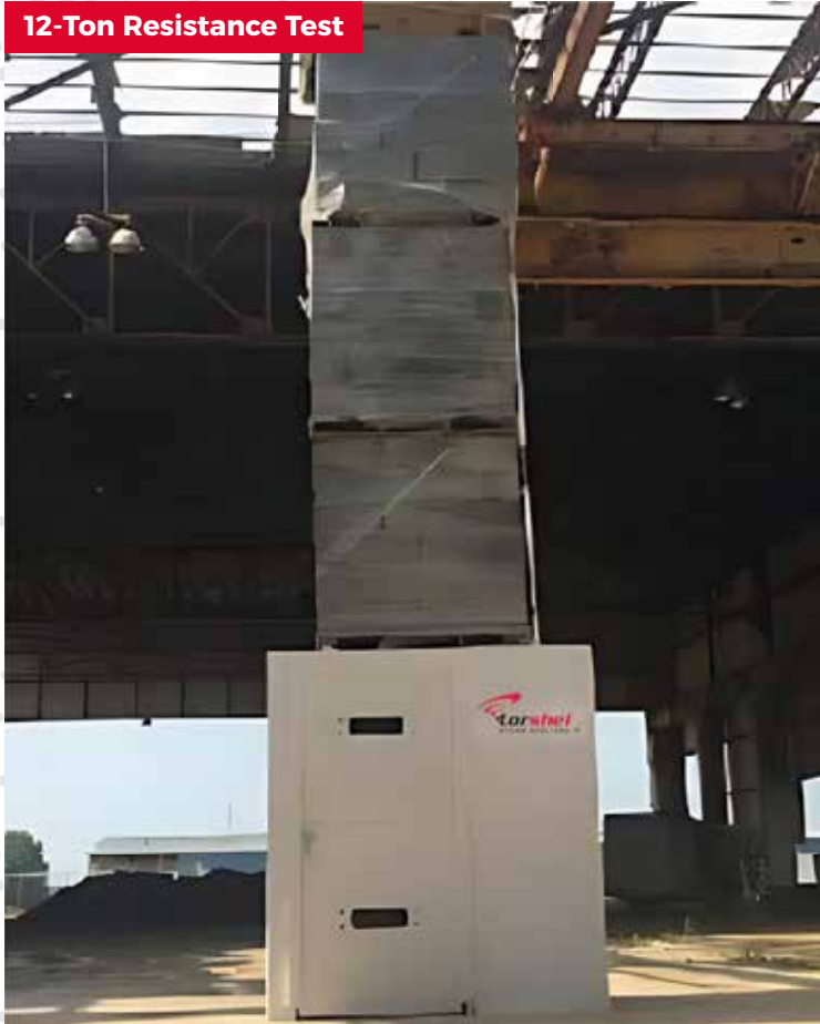
12-Ton Resistance Test