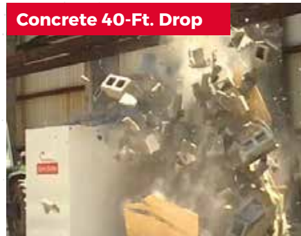
Concrete 40-Ft. Drop